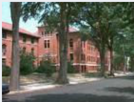
Benedictine H.S. Sheppard St. View